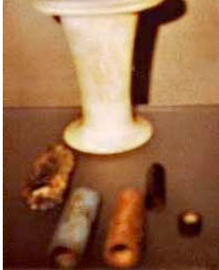
This picture shows Rods of the Pharaoh, Pihopy the II. Picture taken at The Metropolitan Art Museum in New York, in the Spring of 1998.

The Priests and Pharaohs of Ancient Egypt used these metal cylinders with different fillings as an instrument to achieve their high aims, that allowed them to realize step-by-step evolution of their psychic, energetic and, as consequence, their physical abilities. These abilities were necessary for preparation of the "communication with the Gods" in combined with the help of the Pyramids.